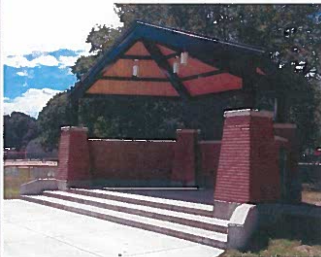
Example of a park bandshell structure