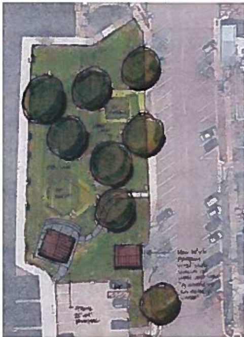
Example Site Plan from City’s Park Plan