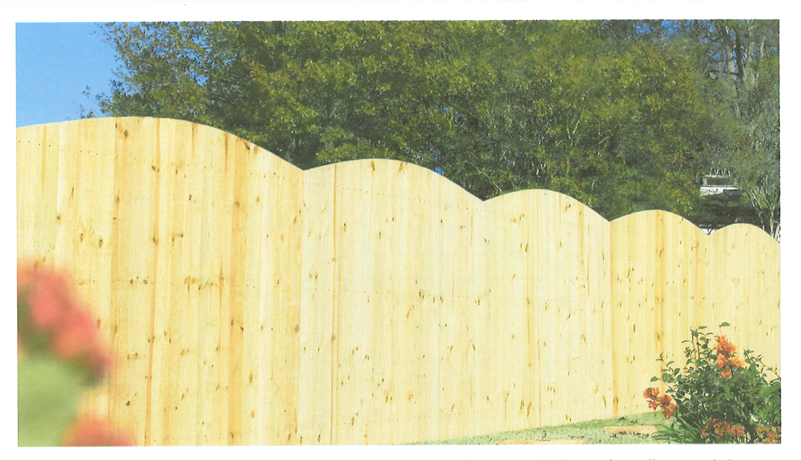
6 feet and 10 inches at the highest point. This is the fencing I would like to install around the backyard of my property.